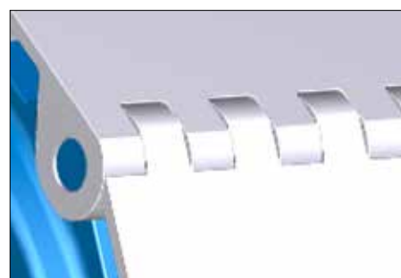
The best-in-class uni-chains hinge system keeps belt maintenance simpler and easier.